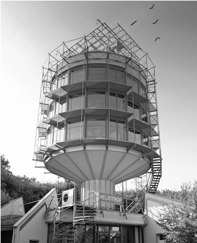
Fig. 2. Heliotrop, Freiburg.

Although there is a need for analysis of typical CABS projects, it is not within the scope of this paper to present case study descriptions and technical details of specific projects. Such detailed analyses would require data that is not commonly available, in particular, construction details and information about CABS' monitored operational performance and post occupancy evaluations are lacking in literature. For an overview of typical projects, the reader is referred to the database in Ref. [24], which has been continuously updated and covers at the moment more than two hundred examples of buildings with CABS.